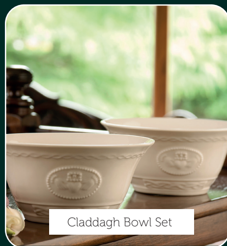
Claddagh Bowl Set