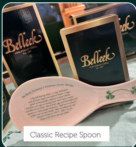
Classic Recipe Spoon