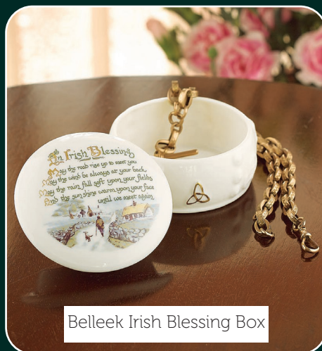
Belleek Irish Blessing Box