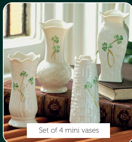
Set of 4 mini vases