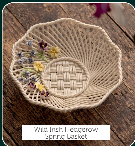
Wild Irish Hedgerow Spring Basket