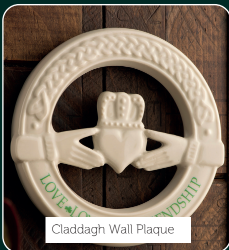
Claddagh Wall Plaque