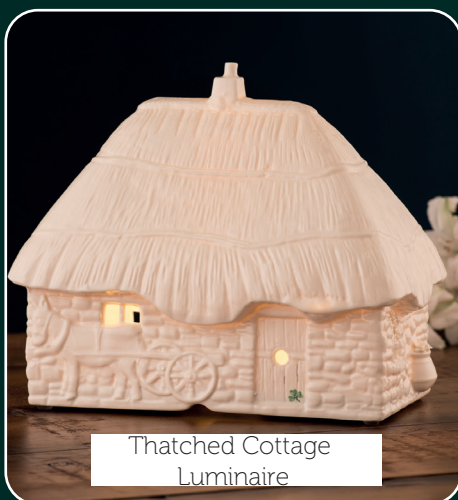
Thatched Cottage Luminaire