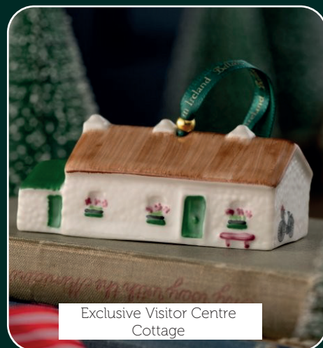
Exclusive Visitor Centre Cottage